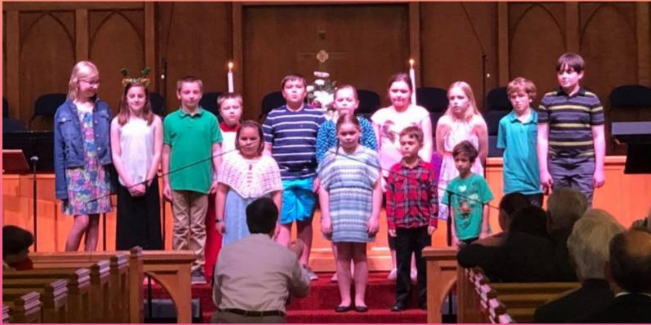
Our children's choirs sang in worship on Sunday, March 18.